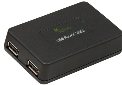
REX (Remote Extender)