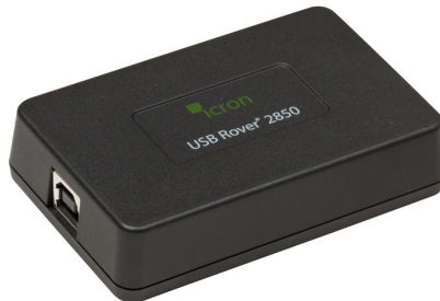
LEX (Local Extender)